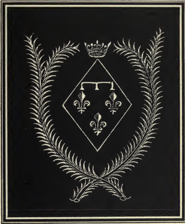
MADemoiselle DE MONTPENSIER, CALLED LA GRANDE MADemoiselle.